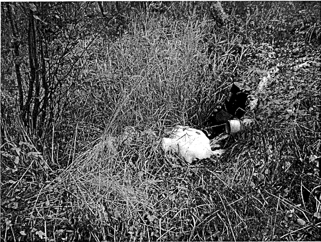
Figure 3. Clover S. D. outlet pipe discharging effluent to dry run ravine.