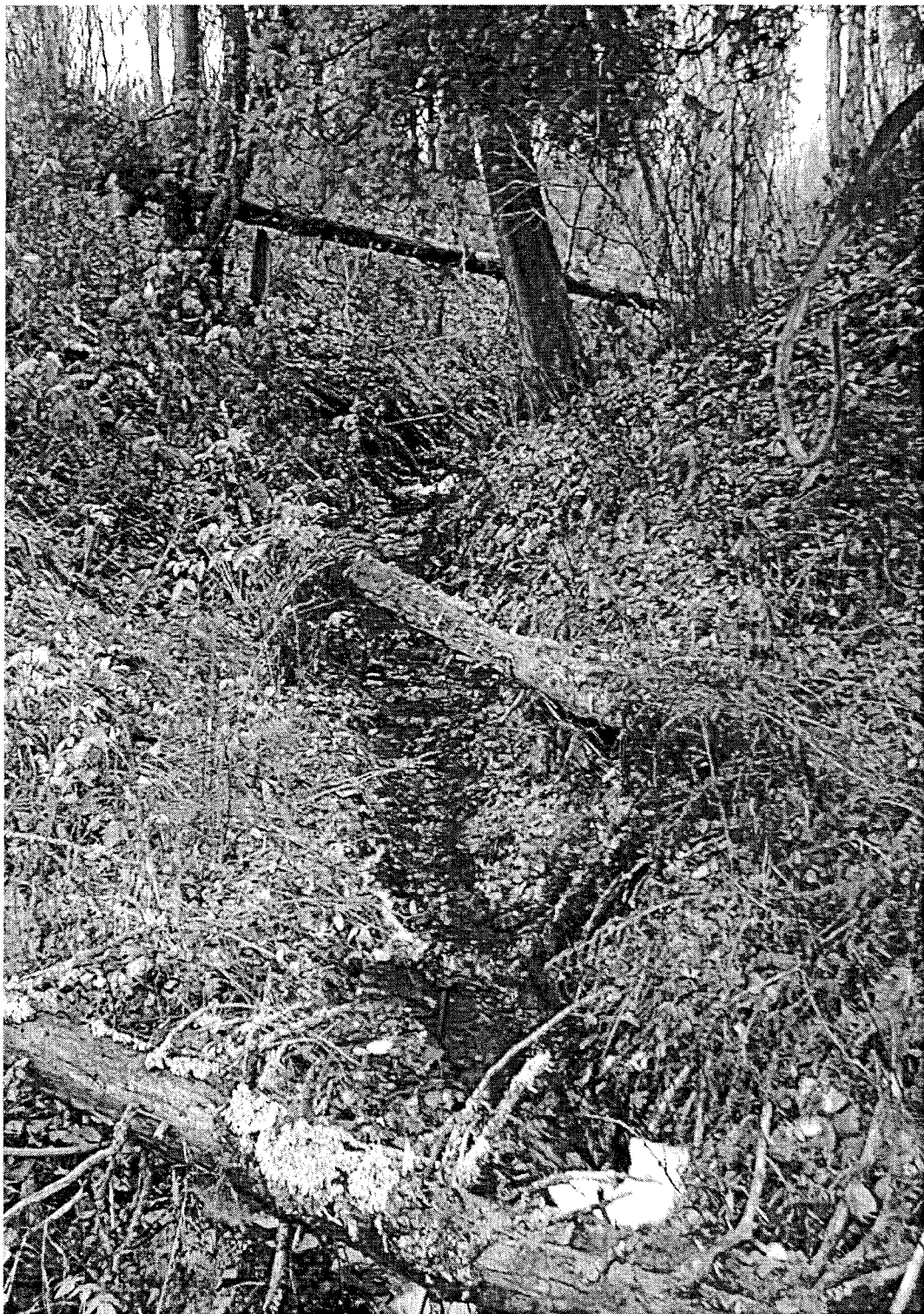
Figure 5. Smaller ravine that receives Clover S. D. effluent discharge, upstream of main ravine channel.