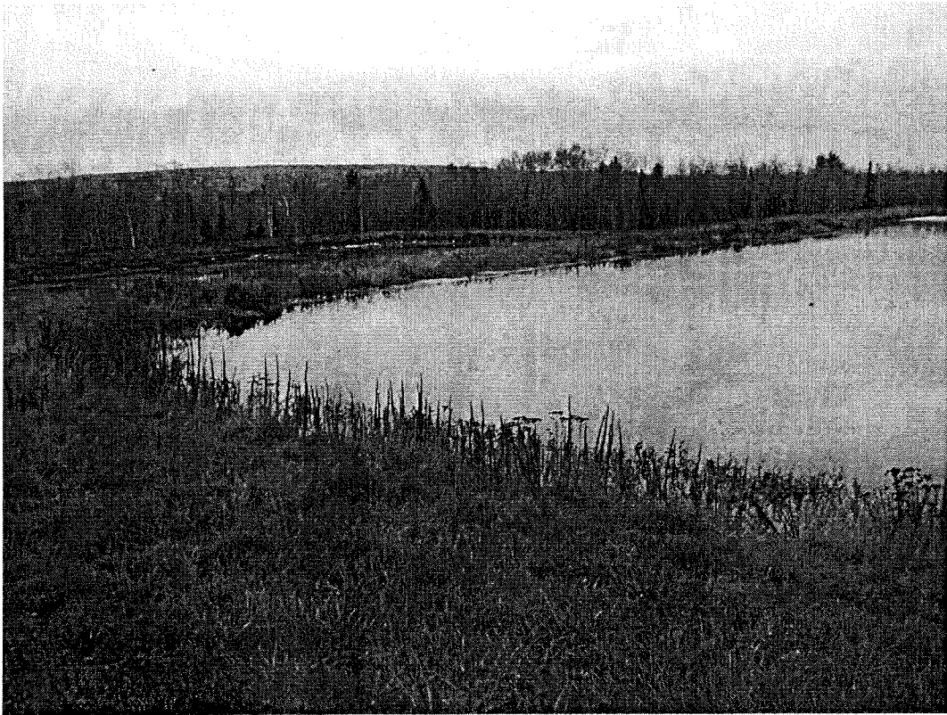
Figure 2. Clover S. D. wastewater treatment ponds, facing southeast.