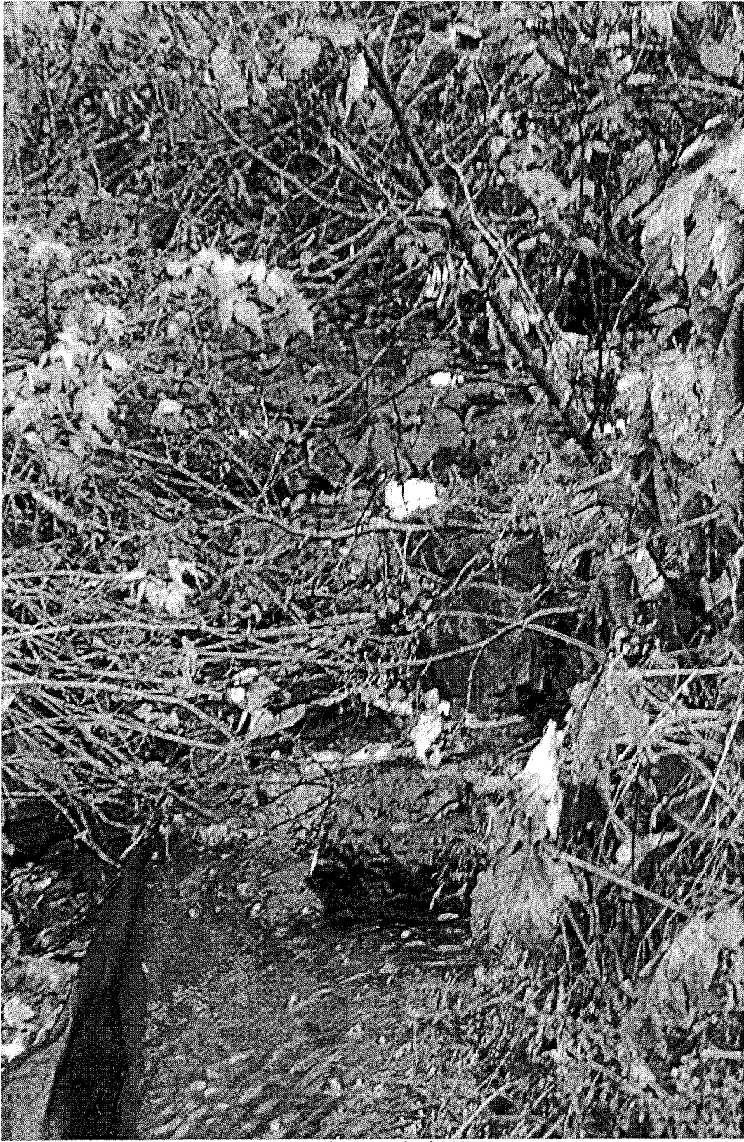
Figure 5. View of main ravine downstream, facing north of CTH 13.