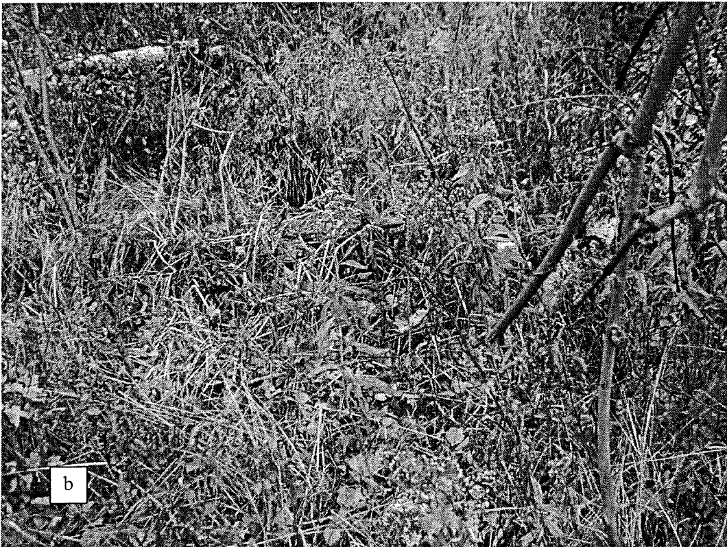
Figures 4a and b. Clover S. D. discharge in dry run ravine area.