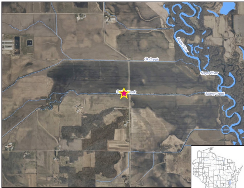
Map Legend ★ - Sampling Location for 2014