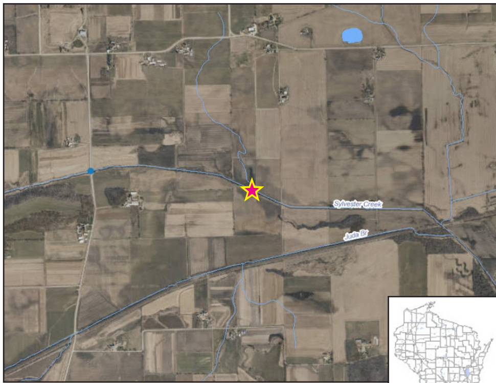
Map Legend ★ - Sampling Location for 2014