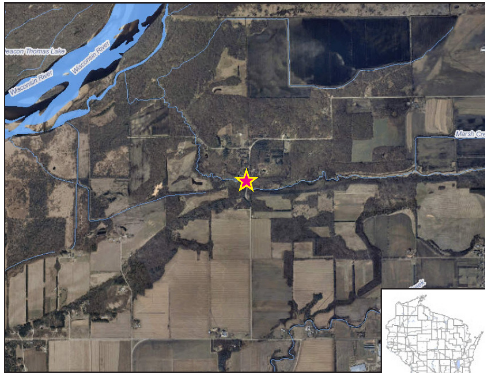
Map Legend - Sampling Location for 2014