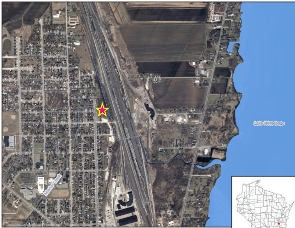
Map Legend - Sampling Location for 2014