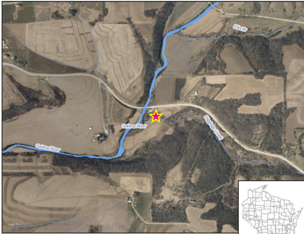
Map Legend - Sampling Location for 2014