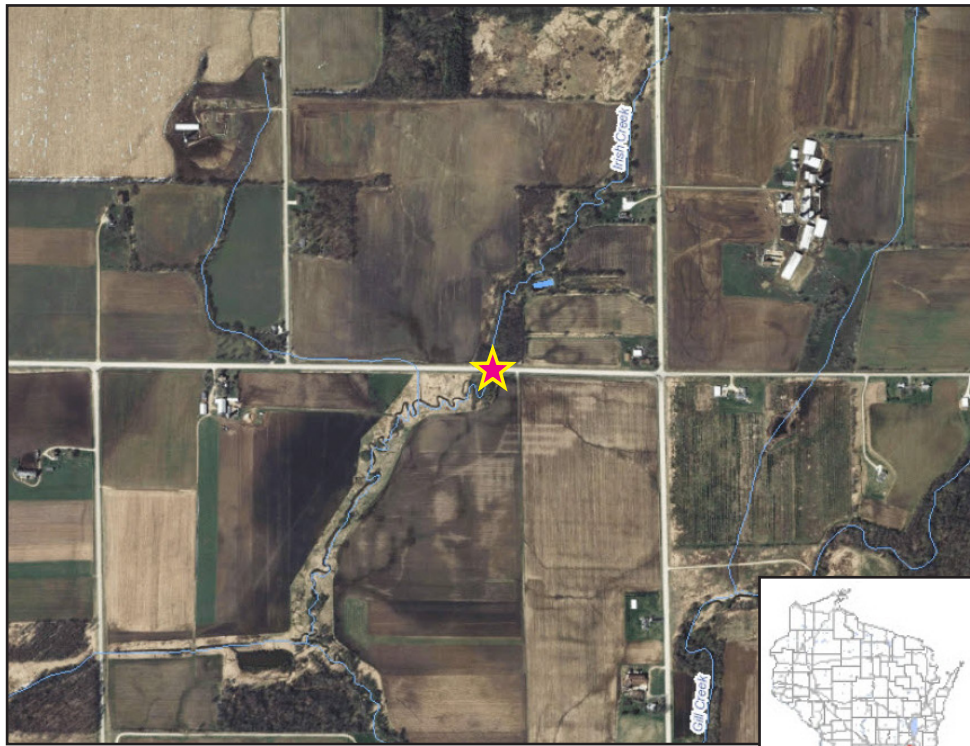
Map Legend ★ - Sampling Location for 2014