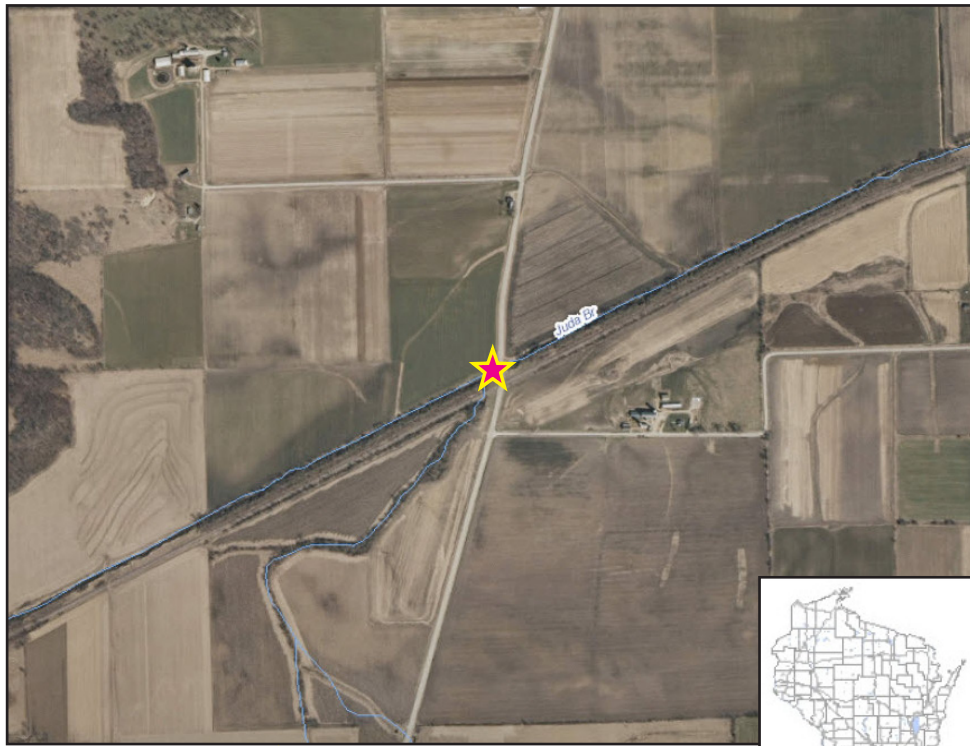
Map Legend ★ - Sampling Location for 2014