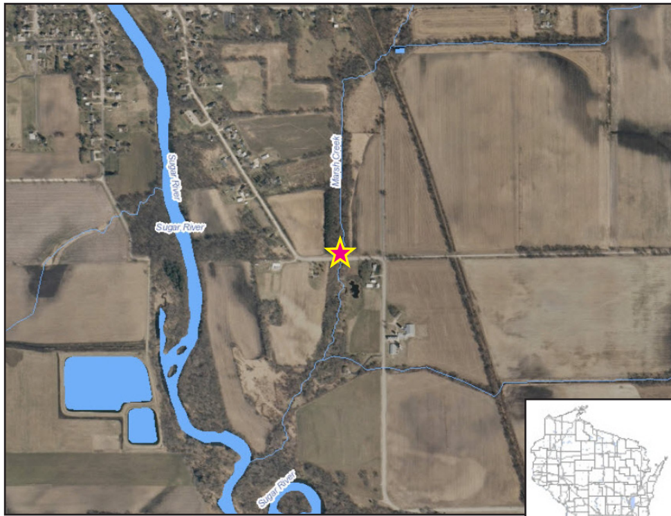
Map Legend ★ - Sampling Location for 2014