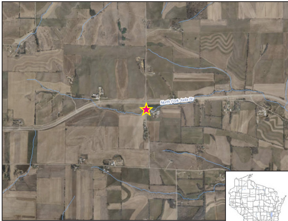
Map Legend ★ - Sampling Location for 2014