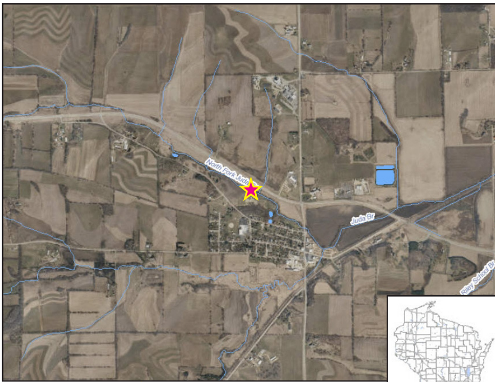
Map Legend ★ - Sampling Location for 2014