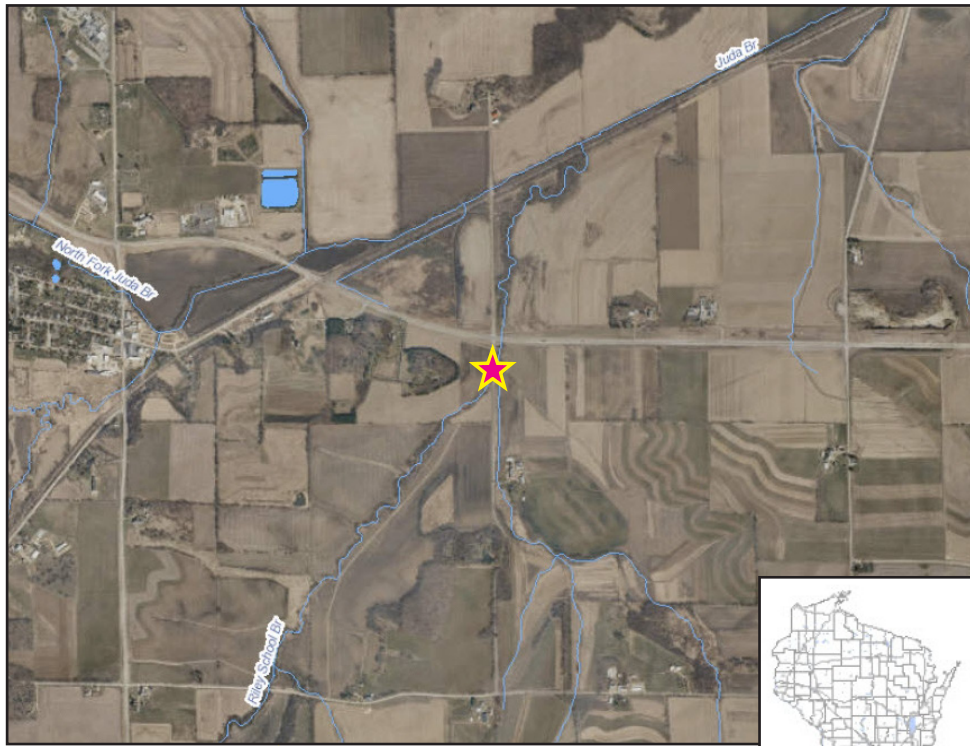
Map Legend - Sampling Location for 2014