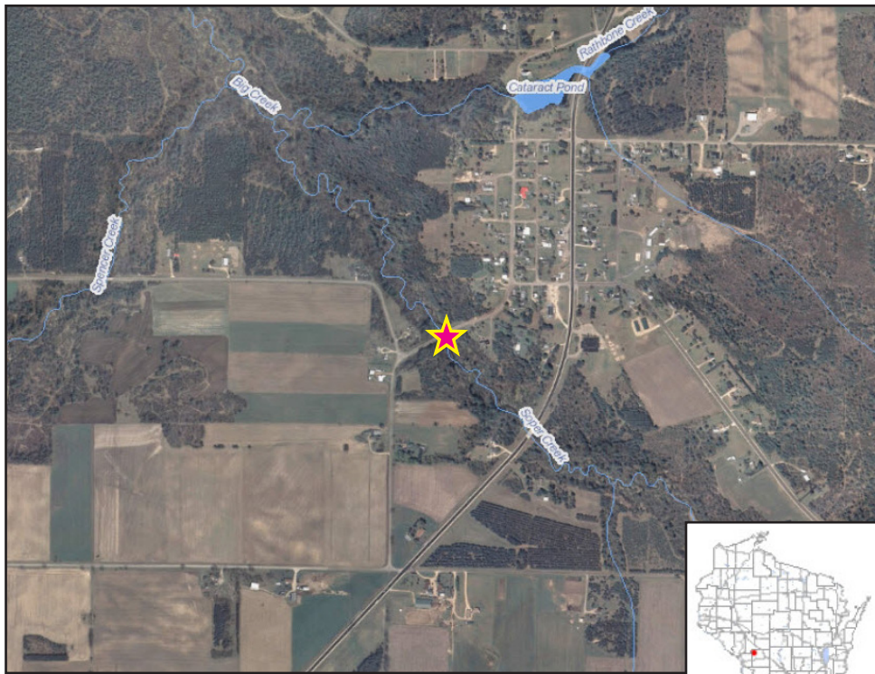
Map Legend - Sampling Location for 2014