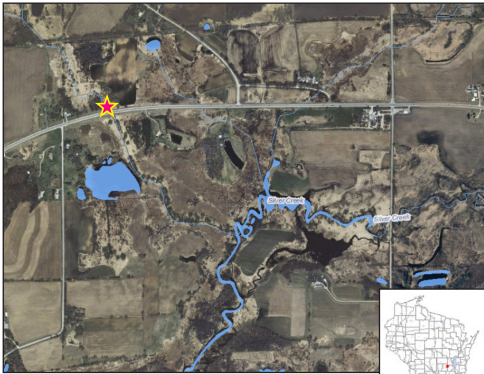
Map Legend - Sampling Location for 2014