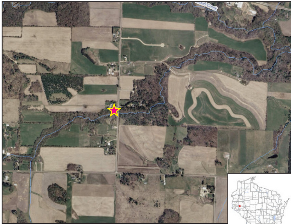
Map Legend ★ - Sampling Location for 2014