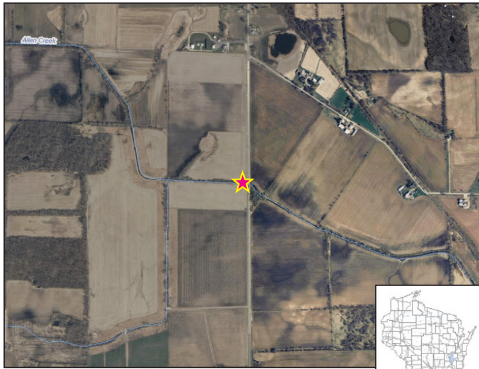
Map Legend - Sampling Location for 2014