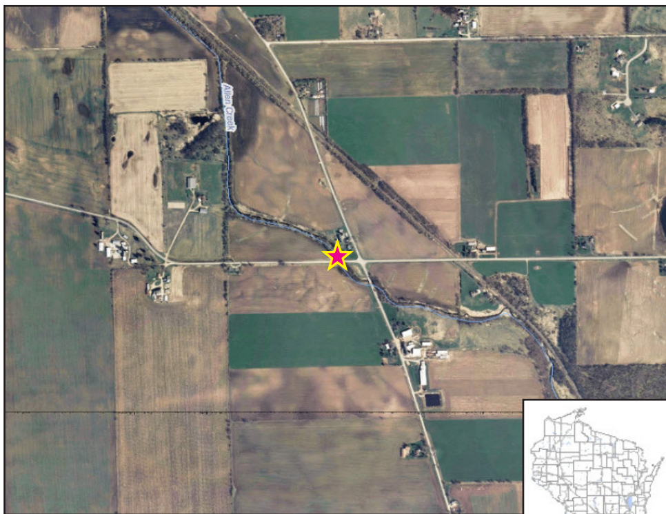
Map Legend - Sampling Location for 2014