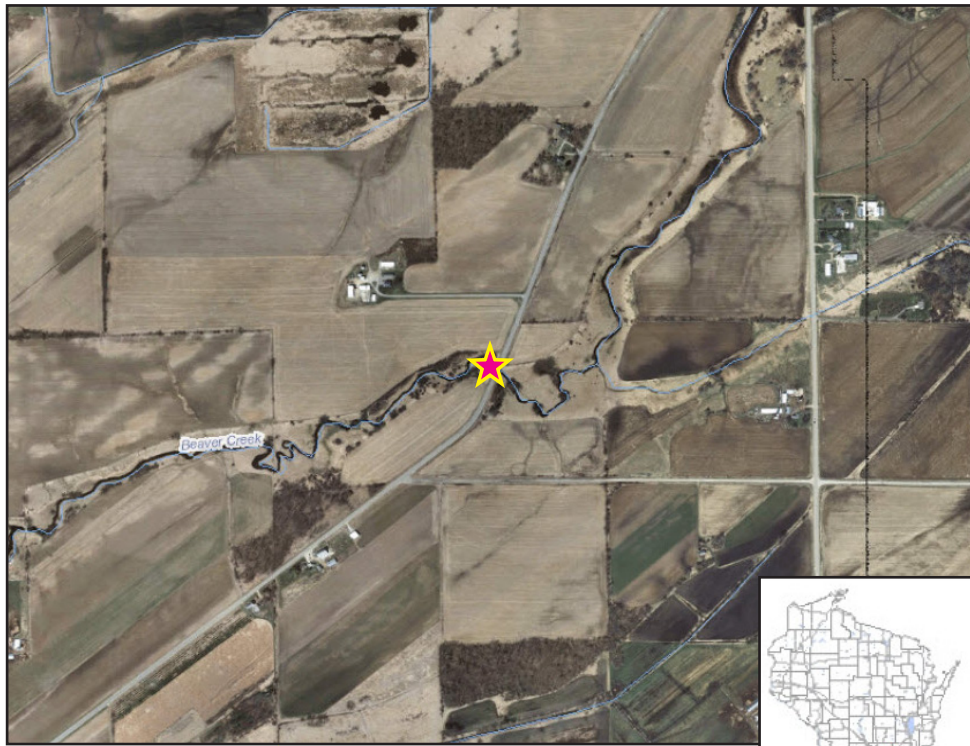
Map Legend ★ - Sampling Location for 2014