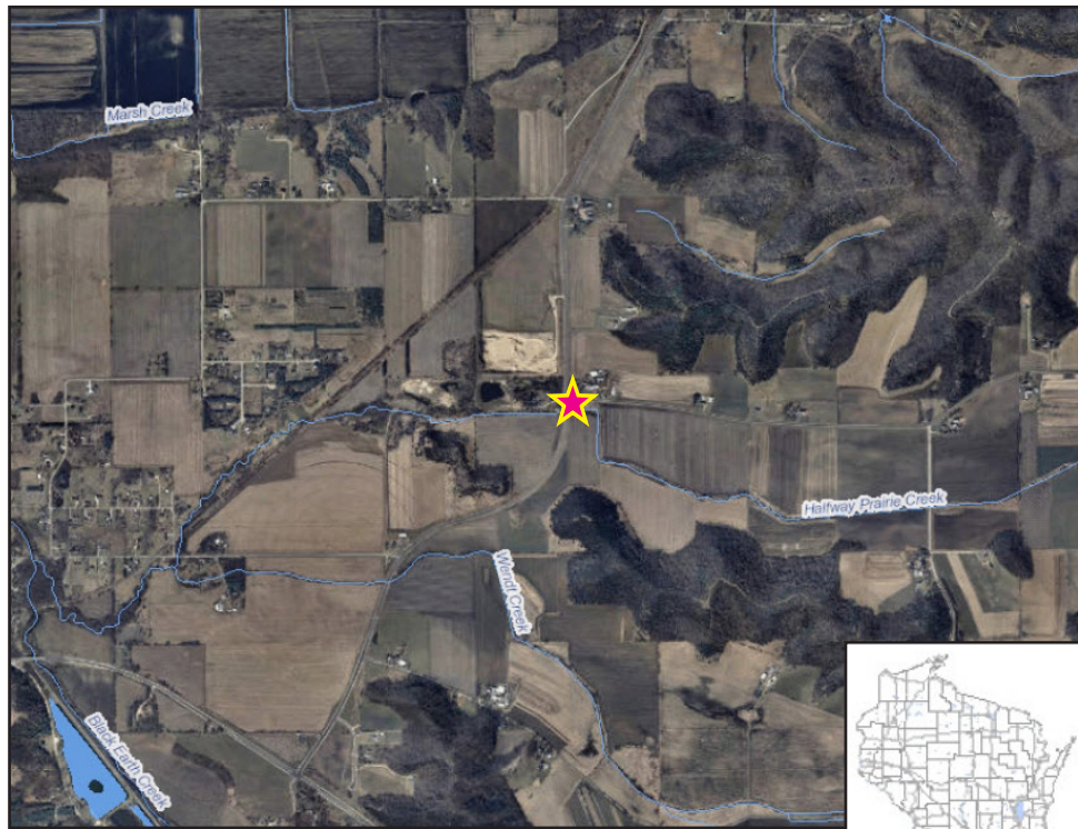
Map Legend - Sampling Location for 2014