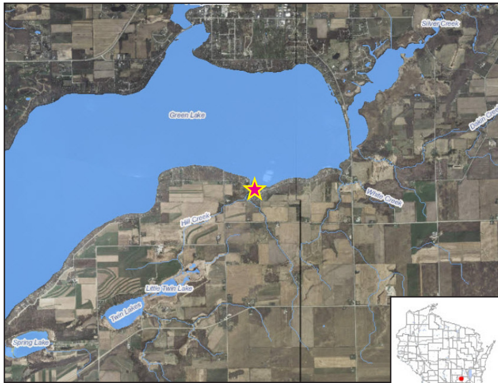
Map Legend - Sampling Location for 2014