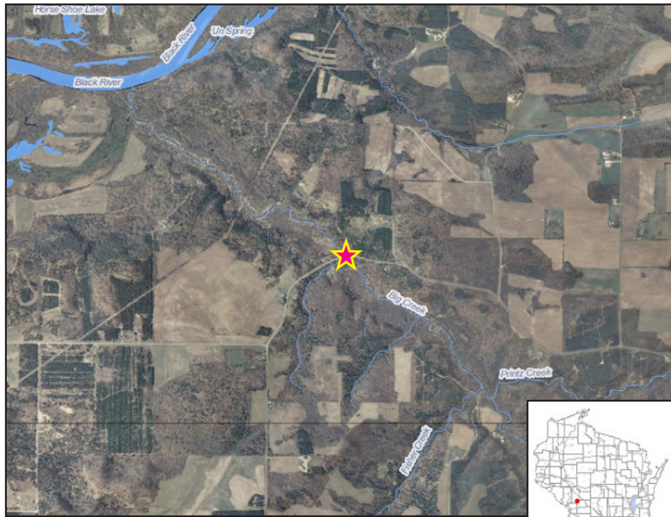
Map Legend - Sampling Location for 2014