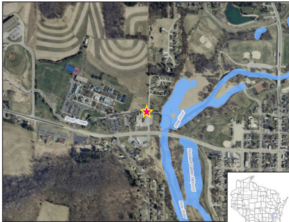
Map Legend - Sampling Location for 2014