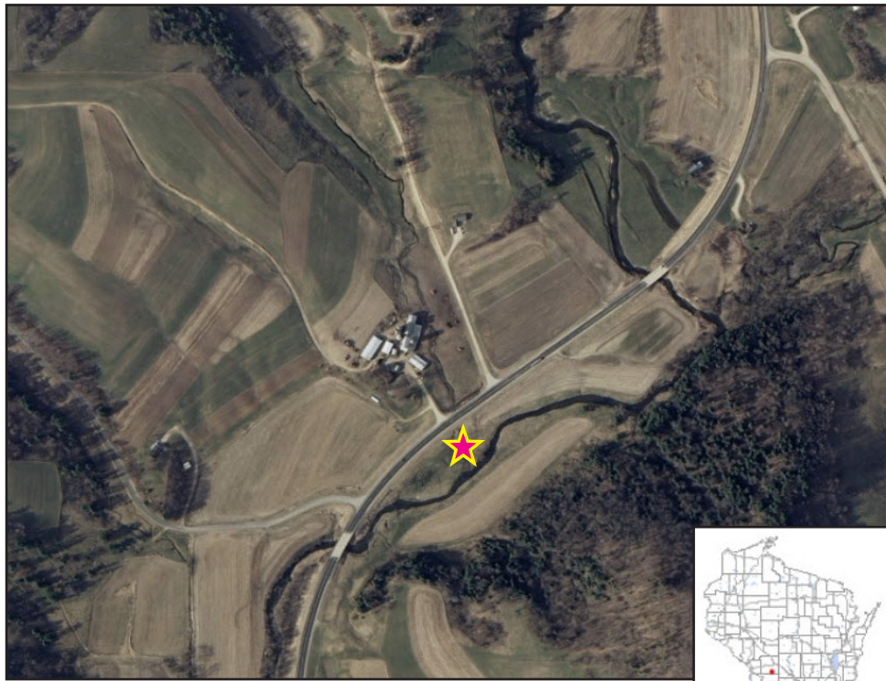
Map Legend - Sampling Location for 2014