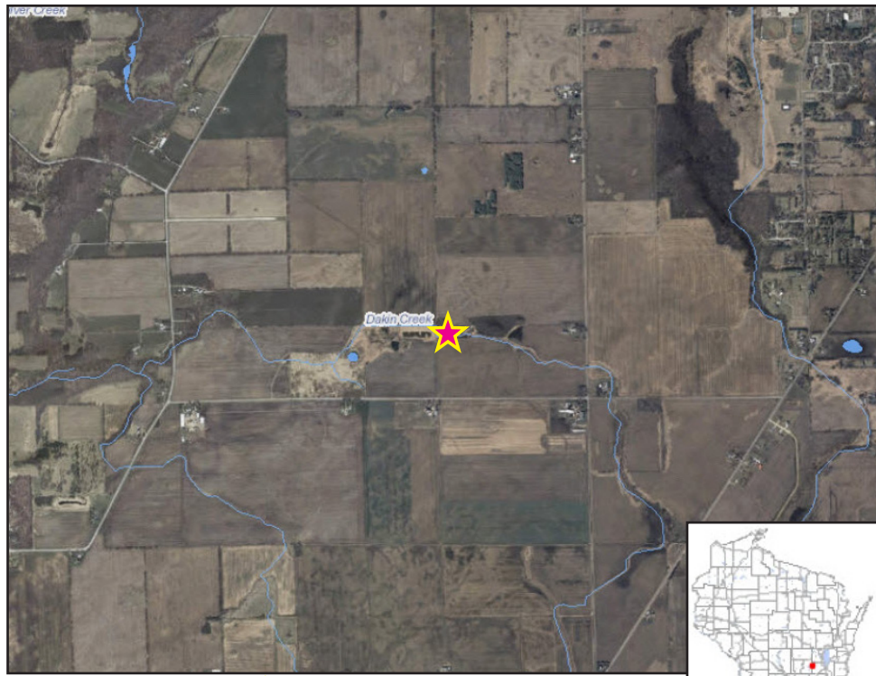
Map Legend ★ - Sampling Location for 2014