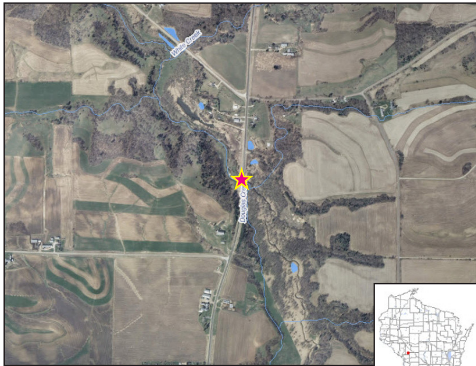
Map Legend - Sampling Location for 2014