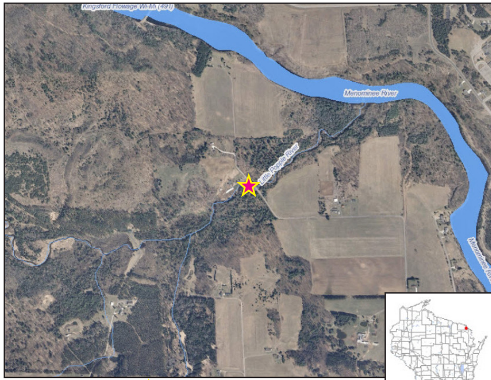
Map Legend - Sampling Location for 2014