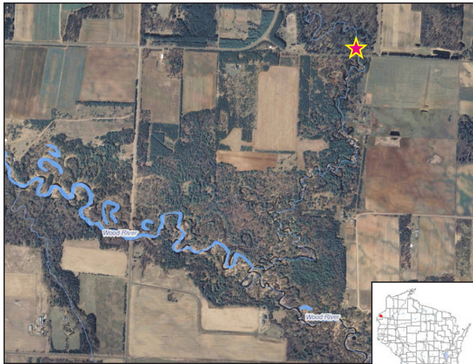
Map Legend ★ - Sampling Location for 2014