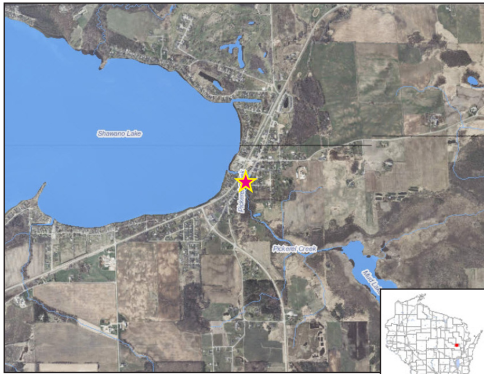
Map Legend - Sampling Location for 2014