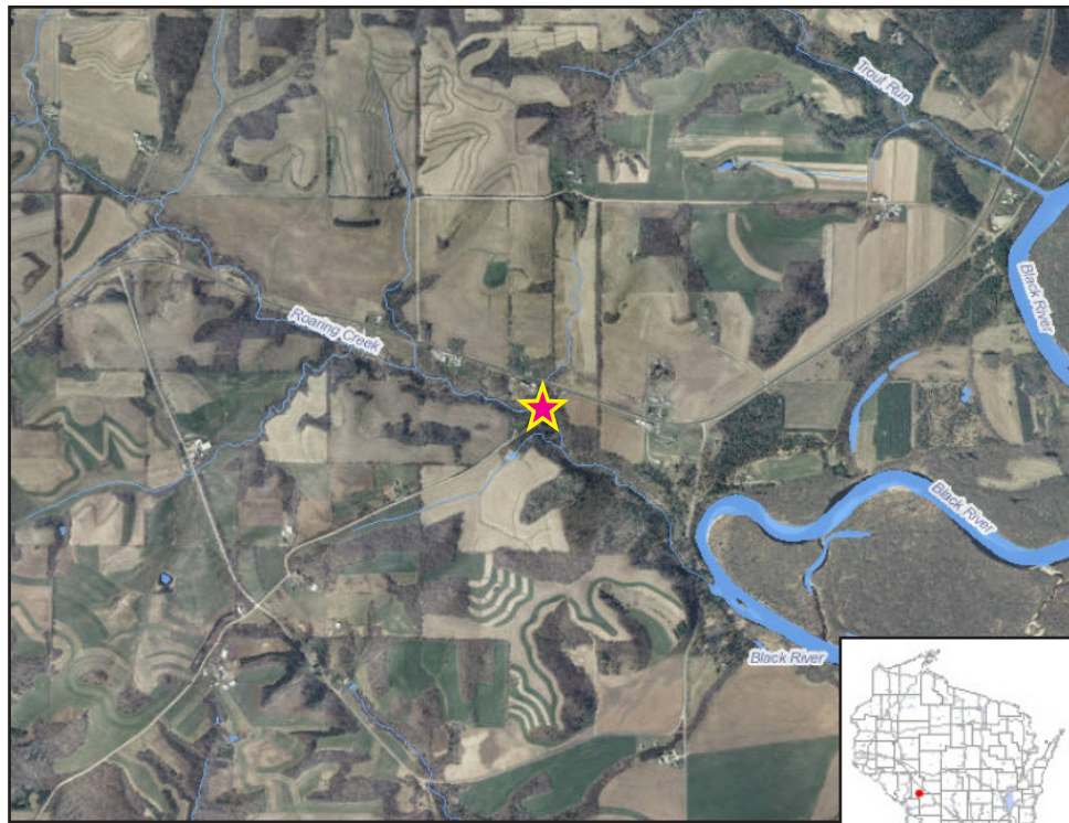
Map Legend - Sampling Location for 2014