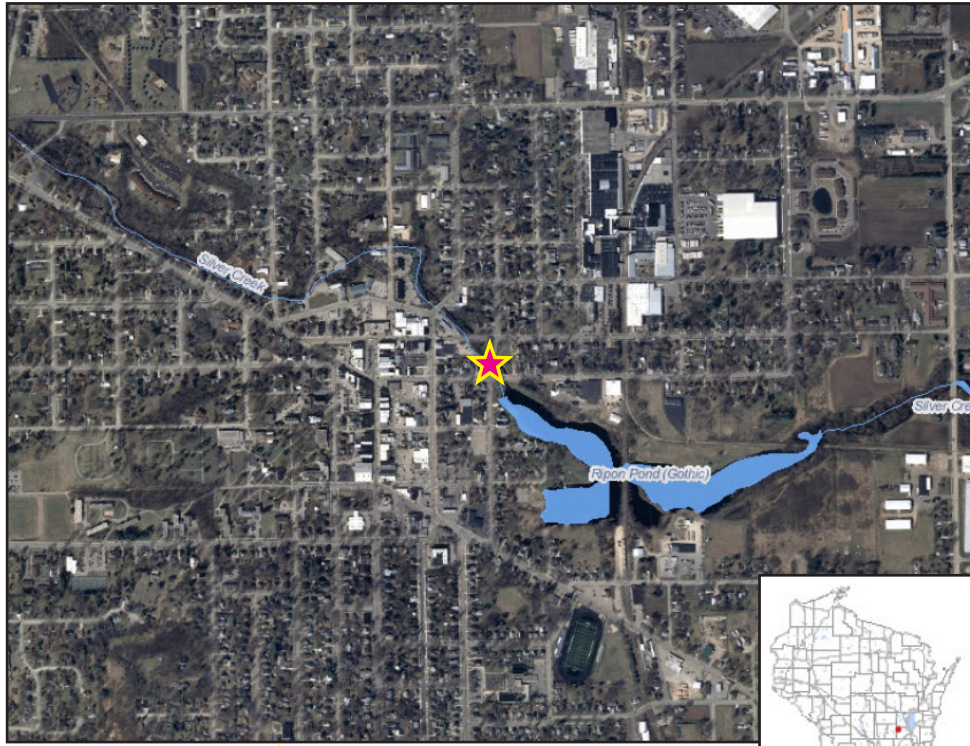
Map Legend - Sampling Location for 2014