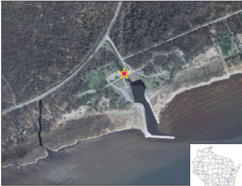
Map Legend - Sampling Location for 2014