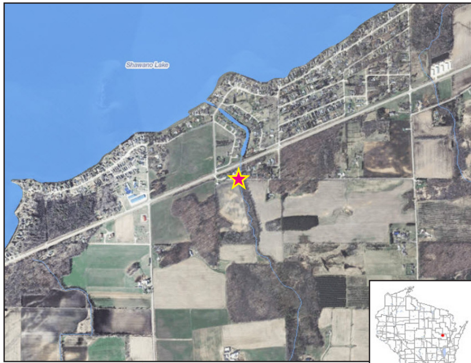
Map Legend - Sampling Location for 2014