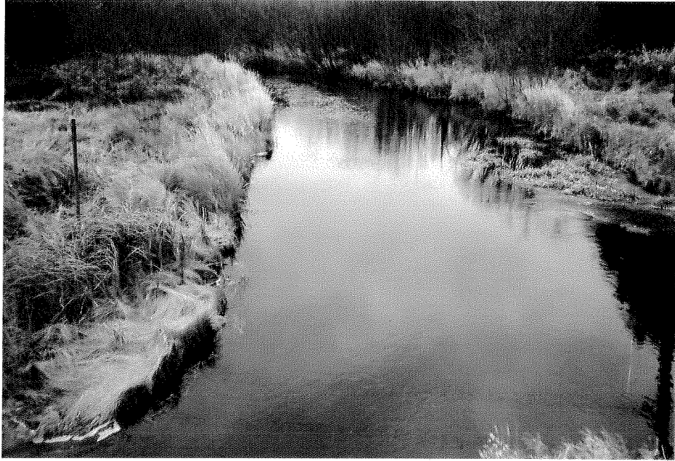
Hunting River at STH 45.