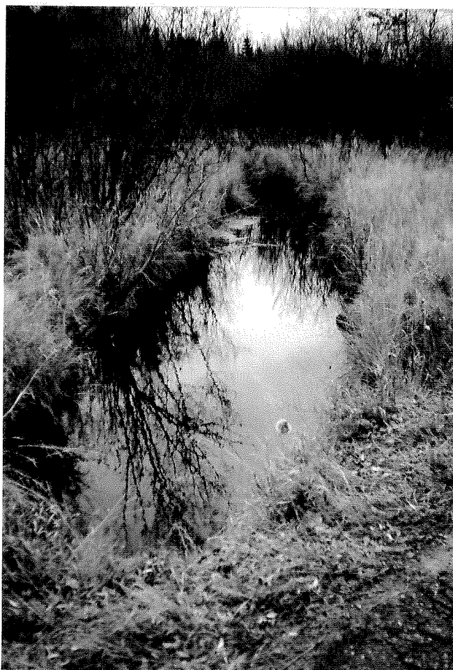
Hunting River 400 yards below outfall.