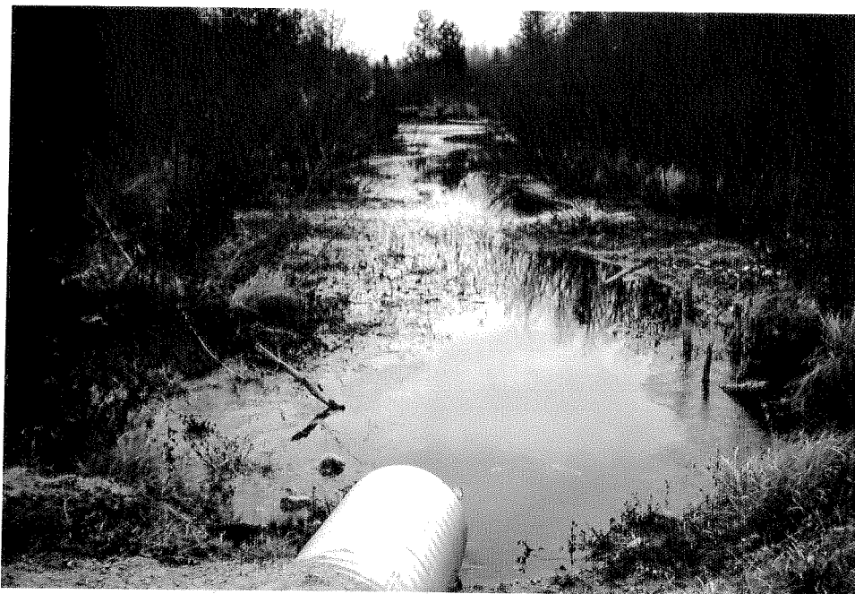
Hunting River above Elcho discharge.