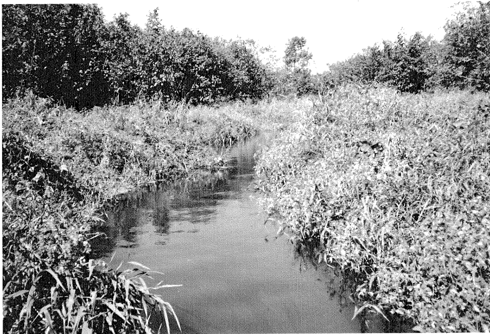
Spring Brook above the sewage treatment plant outfall

There is only limited agricultural usage above Springbrook Road, with the area below Springbrook Road having heavy agricultural use. Non-point sources affect the stream in the vicinity of Dorr Street. Fish have been observed above the sewage treatment plant outfall and from Springbrook Road downstream.