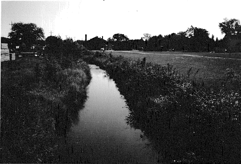
Spring Brook above Kraft Company footbridge in the Town of Antigo

The Antigo sewage treatment plant discharges to Spring Brook, which has a low flow of 3.6 cfs. Above the City of Antigo, there are several locations where Spring Brook widens to form small ponds. In several of these ponds and immediately below the dam in Antigo, brook trout are found. Below the dam, Milbrew, Inc., Baker Canning Company, and Kraft Company all discharge to Spring Brook above the sewage treatment plant outfall.