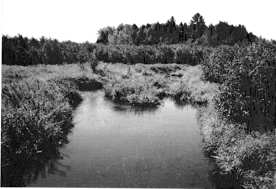
Spring Brook below Springbrook Road