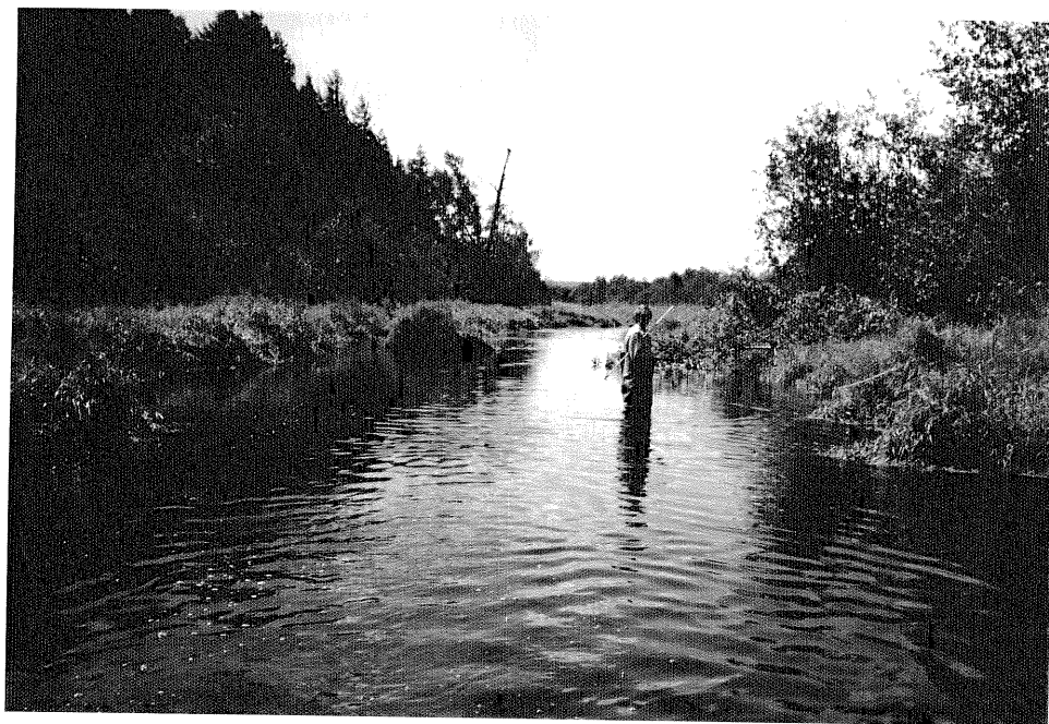
Spring Brook above Springbrook Road