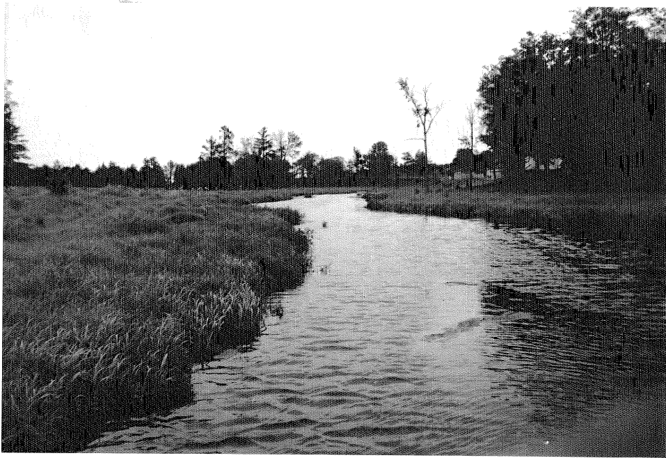
Spring Brook upstream of County Trunk Highway "G"

Recommendations: Spring Brook should be classed as a permanent stream from STH "64" to its confluence with the Eau Claire River, with the stream being classed as fish and aquatic with trout potential.