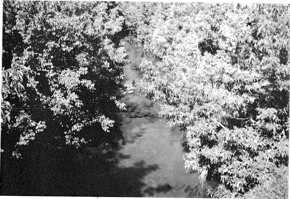
Spring Brook below Kraft Company footbridge in Antigo

There is only limited agricultural usage above Springbrook Road, with the area below Springbrook Road having heavy agricultural use. Non-point sources affect the stream in the vicinity of Dorr Street. Fish have been observed above the sewage treatment plant outfall and from Springbrook Road downstream.