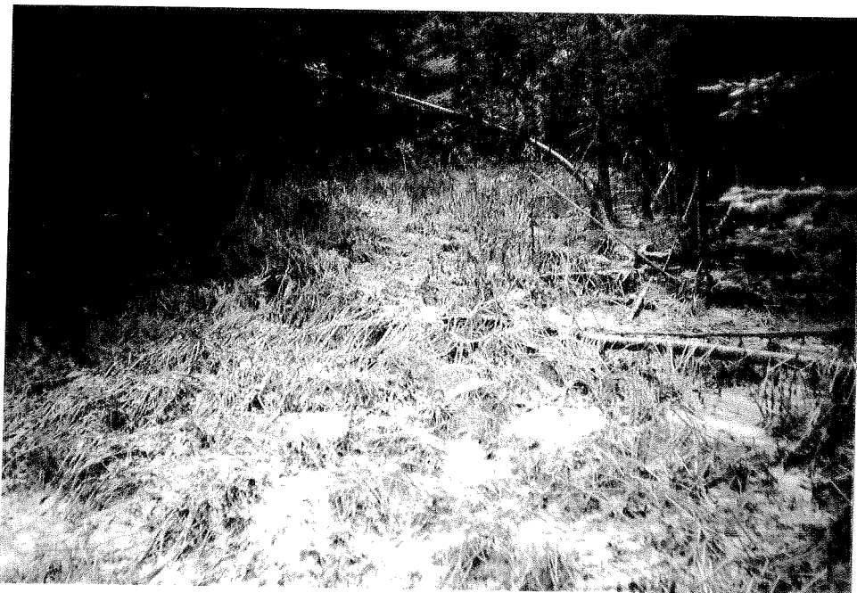
Wetland receiving Northern Lake Terrace discharge.

Recommendations: The receiving area for the Northern Lake Terrace discharge should be classified wetland and, therefore, it has the marginal water quality classification.