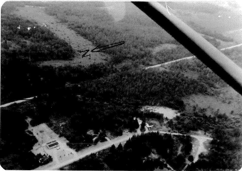
EFFLUENT FLOW TO WETLANDS