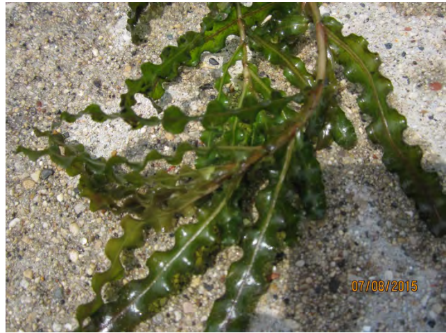
West Branch of the Rock River inside the carp trap 43.617611, -88.677384