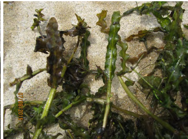
Luehring Impoundment at the watercontrol structure along Ledge Road. 43.597086, -88.637781