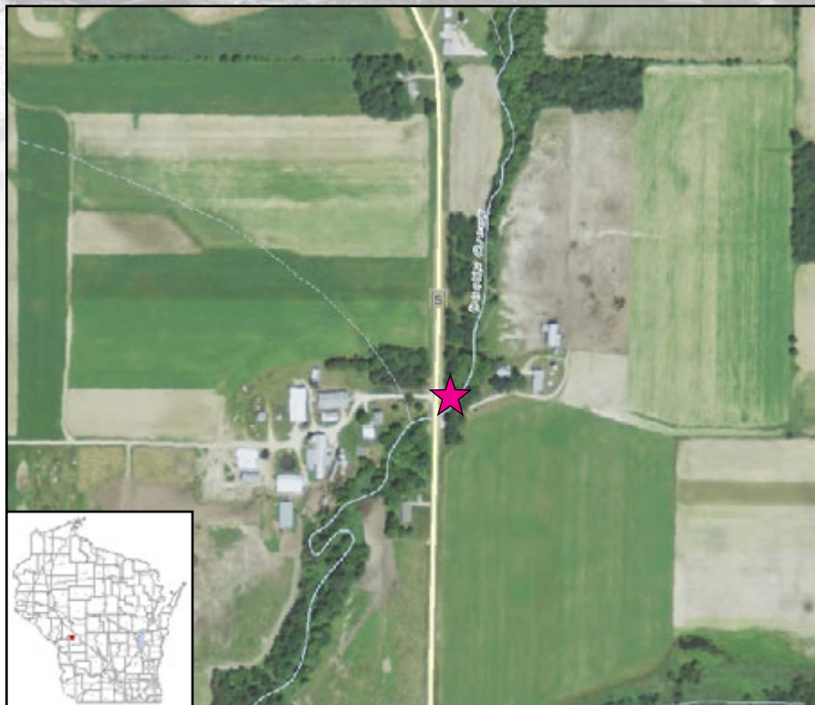
Map Legend - Sampling Location for 2015