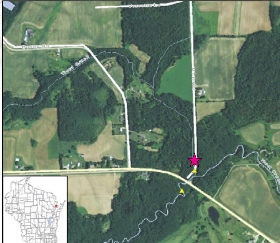
Map Legend - Sampling Location for 2015