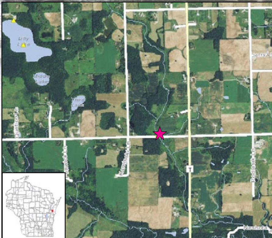
Map Legend - Sampling Location for 2015