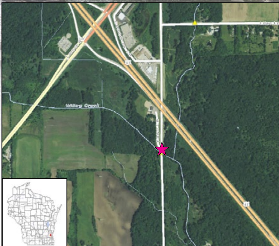
Map Legend ★ - Sampling Location for 2015