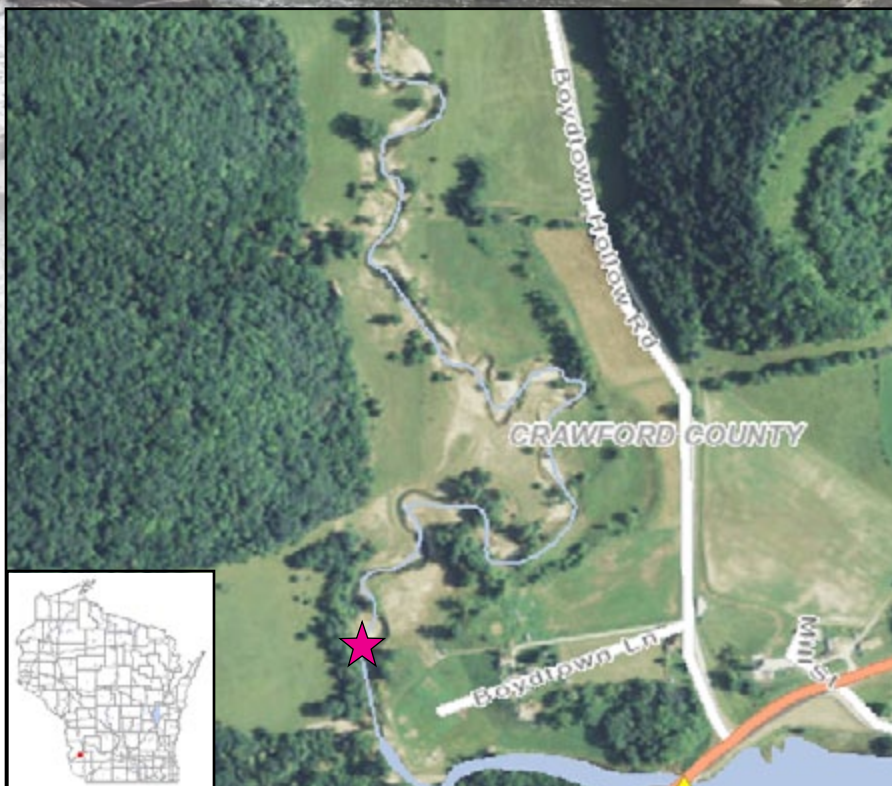
Map Legend ★ - Sampling Location for 2015