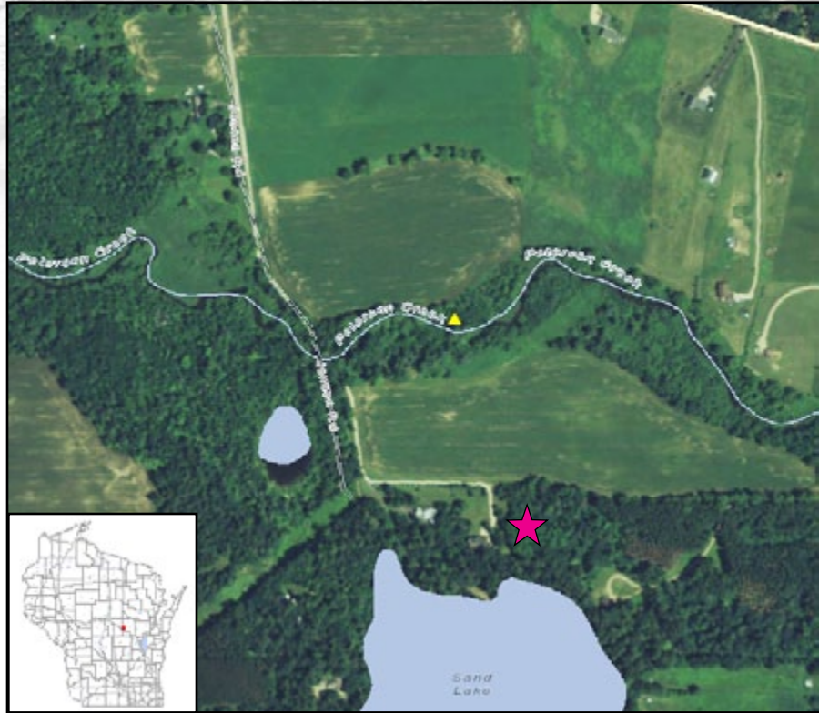
Map Legend - Sampling Location for 2015