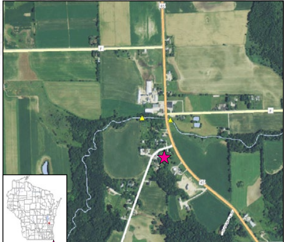
Map Legend ★ - Sampling Location for 2015