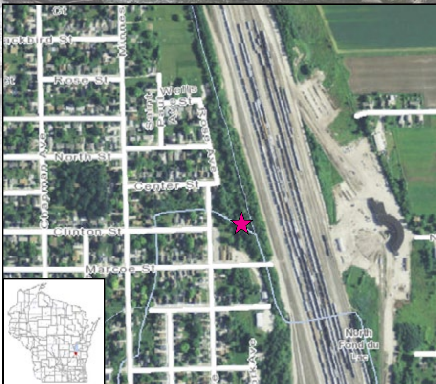
Map Legend ★ - Sampling Location for 2015