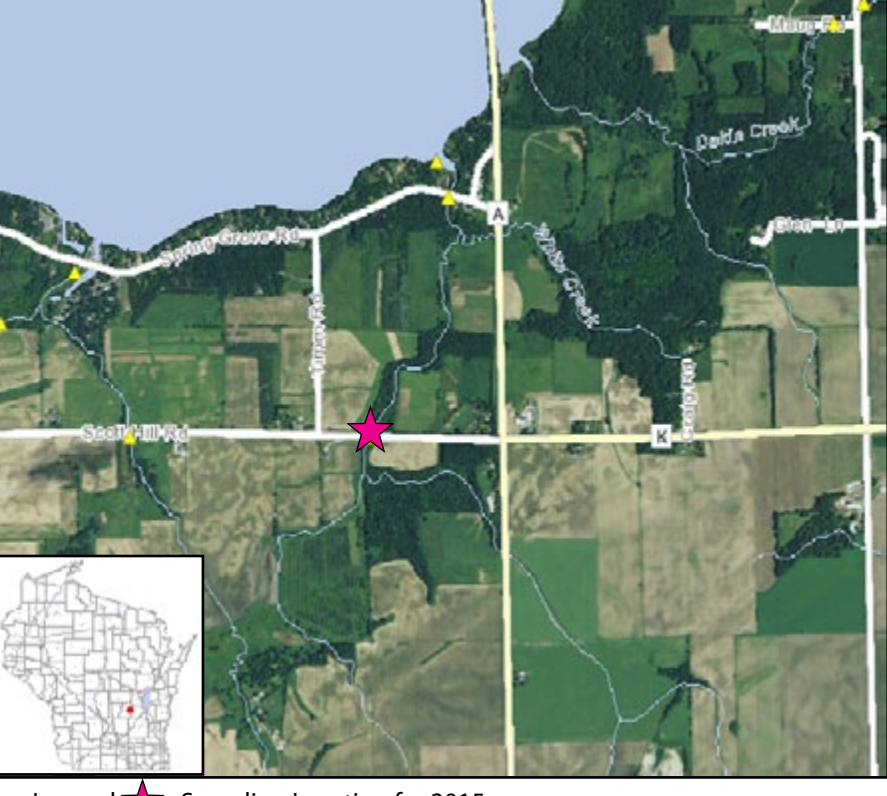
Map Legend 🜟 - Sampling Location for 2015