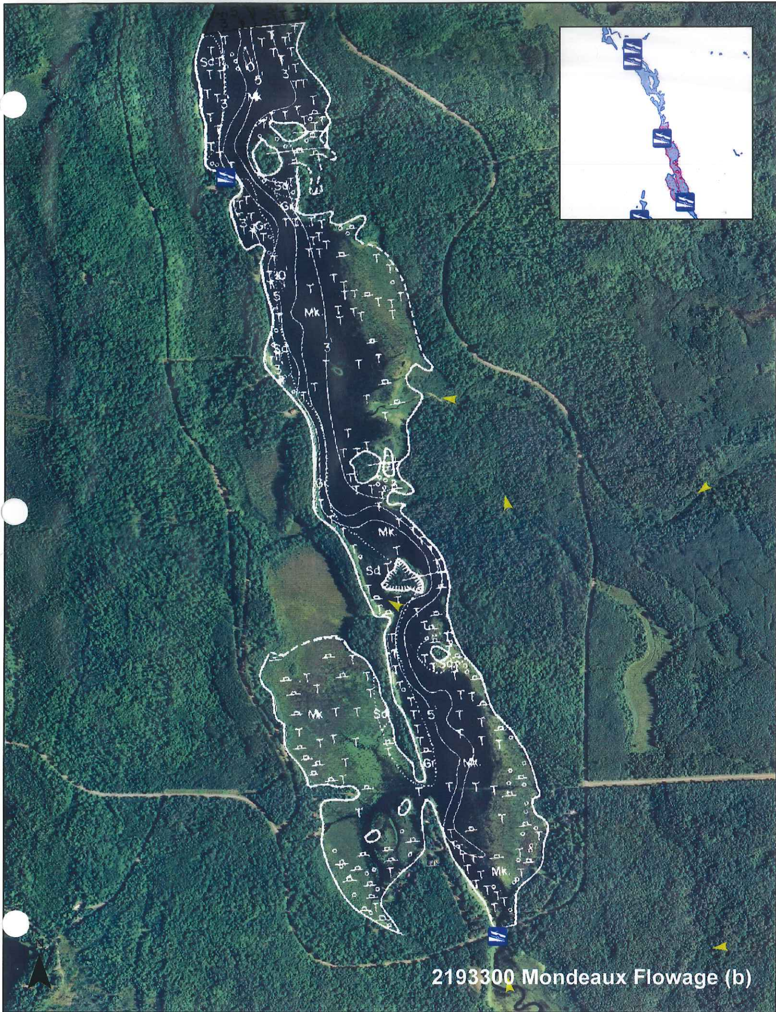
2193300 Mondeaux Flowage (b)