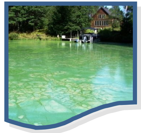
Above: Toxic blue-green algae blooms resulting from excess nutrients in lake water.