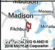
Map of Urban Service Area Amendment Lands and Environmental Corridors