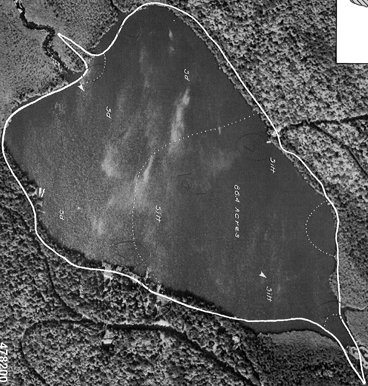
478200 Range Line Lake